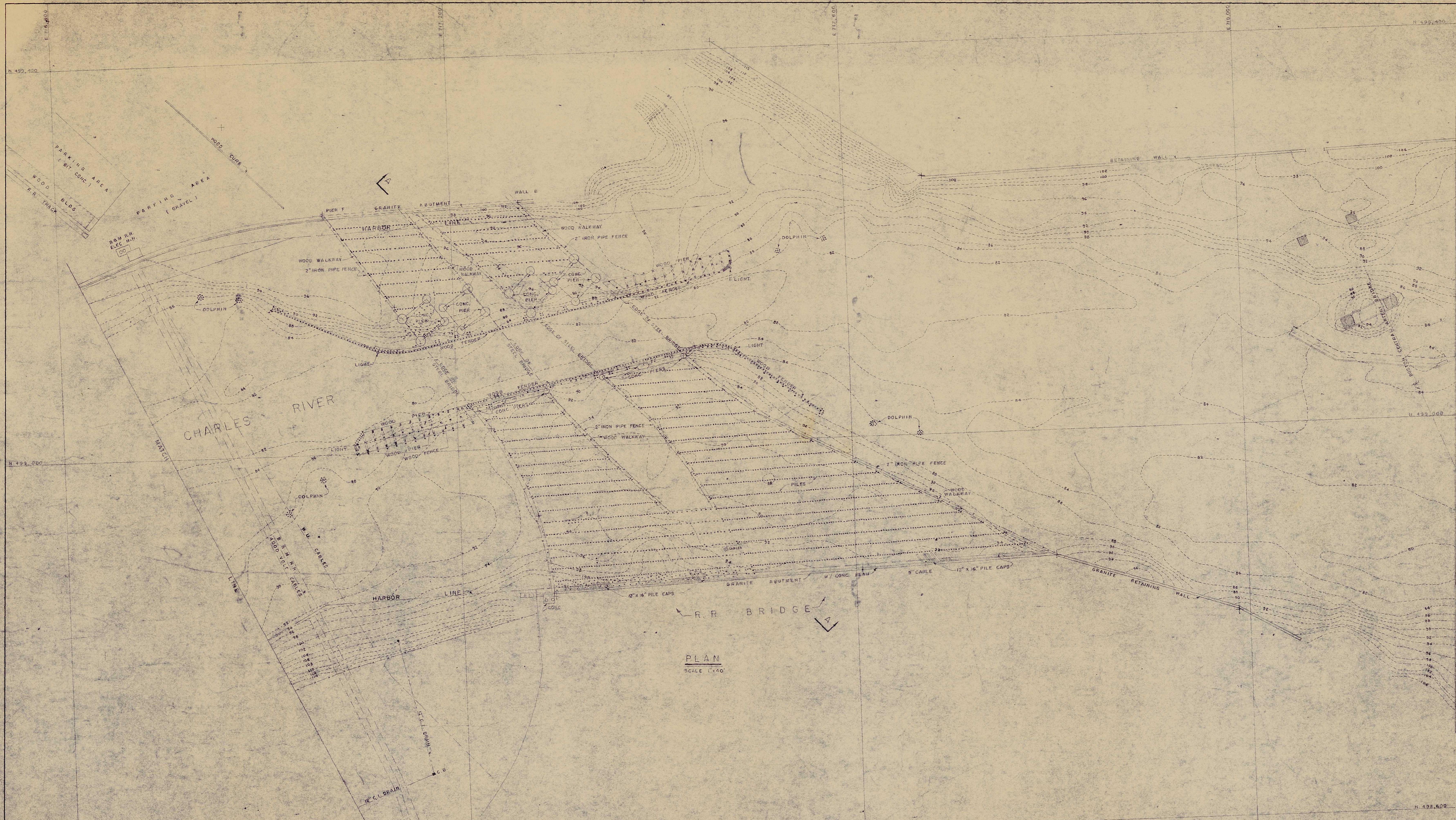
PLAN SCALE 1"=40'