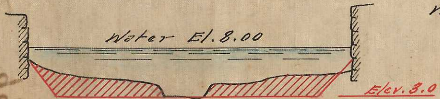
Elev. 0.0 Boston City Base